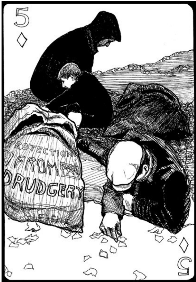
PROTECTION FROM DRUDGERY

A PRISONER NEWSLETTER FOR MISSOURI AND BEYOND